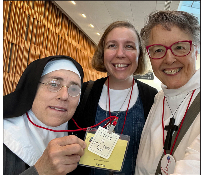
THIS IS MY DAY JOB